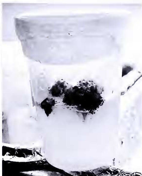
Figure 4: A tissue culture of a pygmy sundew, with the fine roots visible against the side of the container.

cm (6 inches) from the lights for best results. The lights will generate significant amounts of heat, so temperatures in the culture vessels will be higher than ambient temperatures when the lights are lit. You should choose the temperatures that best match the growth requirements of your plants. While 23°C (75°F) is a good, general choice, some Nepenthes might grow better with higher temperatures while Darlingtonia might do better with less heat.